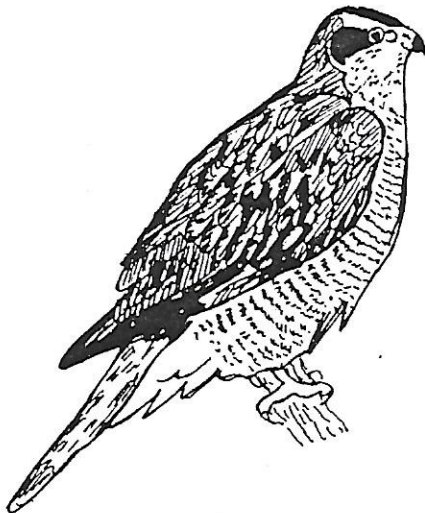
Goshawk f E coast 7 April

Breeding: bred successfully at several locations. Prs and singles seen all yr mainly in the Machrie Moor, Torr Righ and Boguille areas, also seen at BCP, String road, Ross road, Sannox, Glen Rosa, Lenamhor, Laggan, Glen Catacol and Loch Nuis.